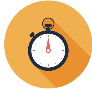
Real-time data update